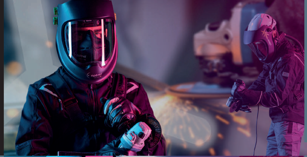
Grinding / metal working / wood working / industrial applications