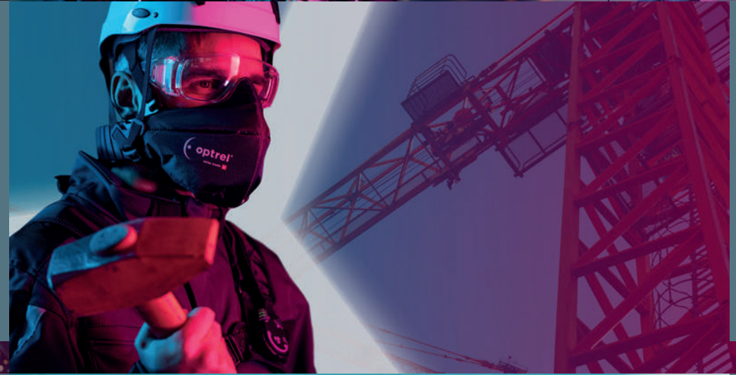
Demolition / Construction / Agriculture / Waste disposal / Recycling