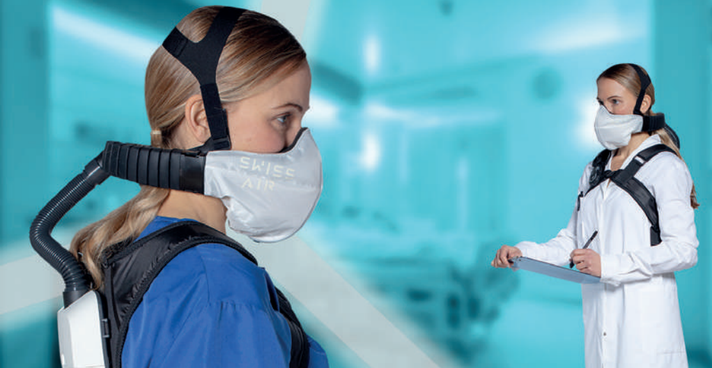
Medical applications / Health care