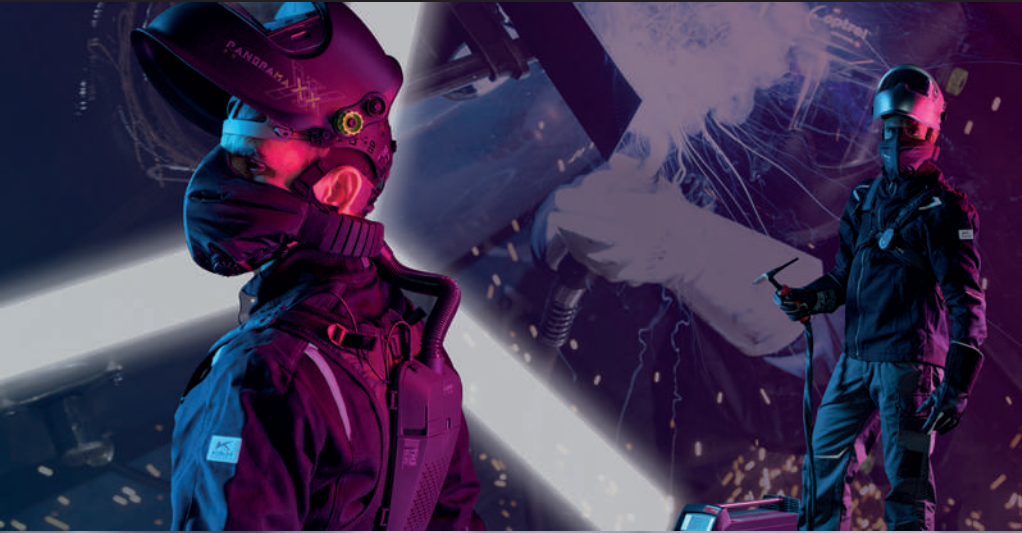
Welding / Plasma cutting