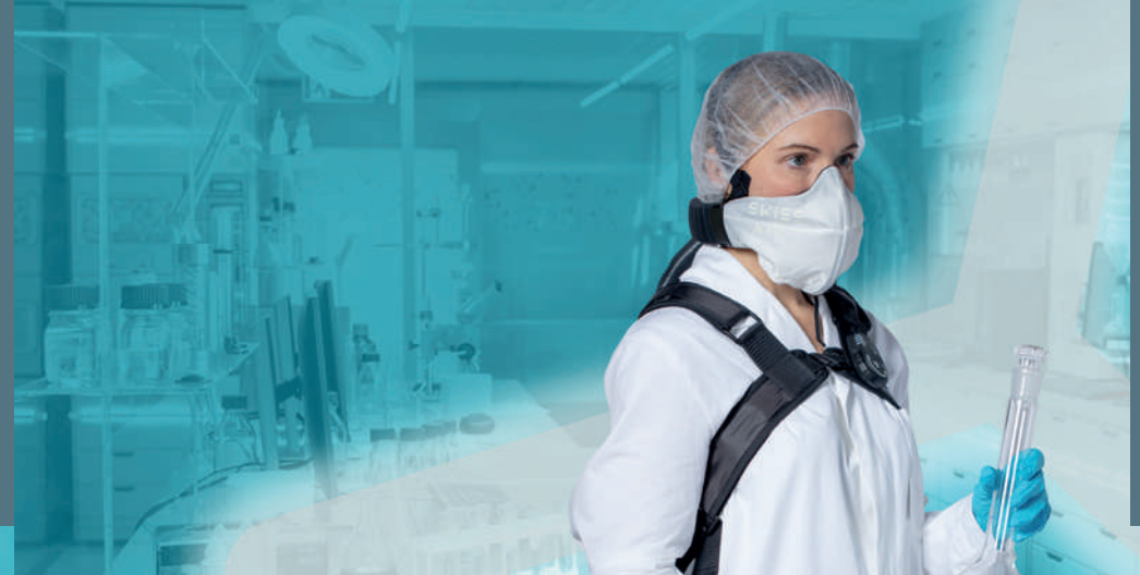
Laboratory applications / pharmaceutical industry